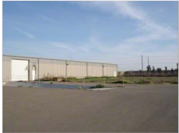
10757 Energy Street