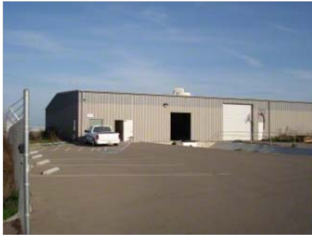
10757 Energy Street