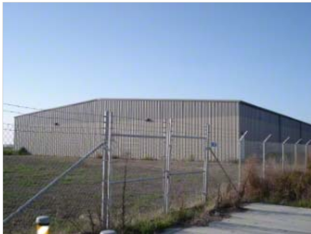
10757 Energy Street