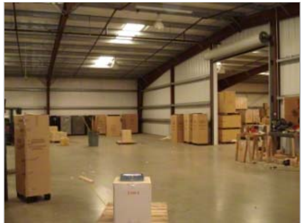
10757 Energy Street