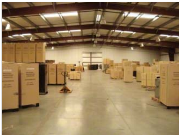
10757 Energy Street