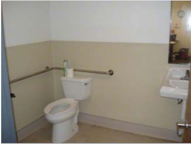
10757 Energy Street